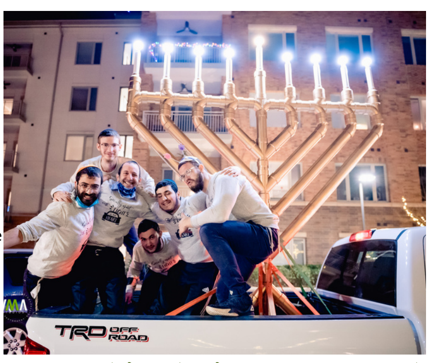
This year's parade featured a 10 ft. Menorah on wheels to spread the holiday joy!

Following the success of last year's Chanukah event, we are making it our goal to expand and improve the celebration on a magnitude that our city has never seen! We plan to host a Covid-safe car parade, outfitting 50+ cars with car top Menorahs. The parade will end at Lafayette village at our grand event & outdoor Menorah lighting celebration. It would cost a total of $10,000 to cover the expenses of this next huge step.