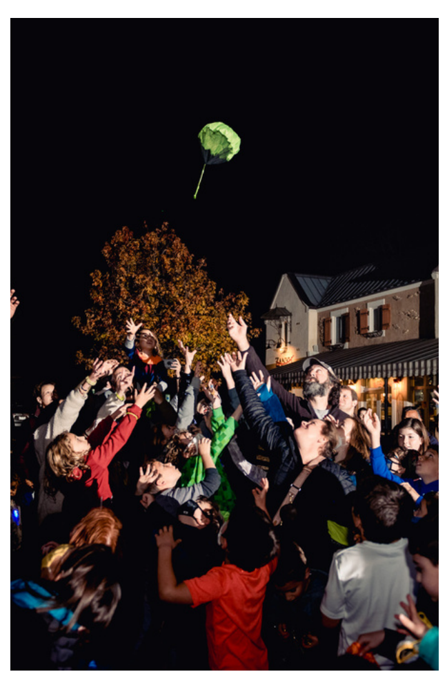
"Gelt Drop" at 2021 Chanukah event