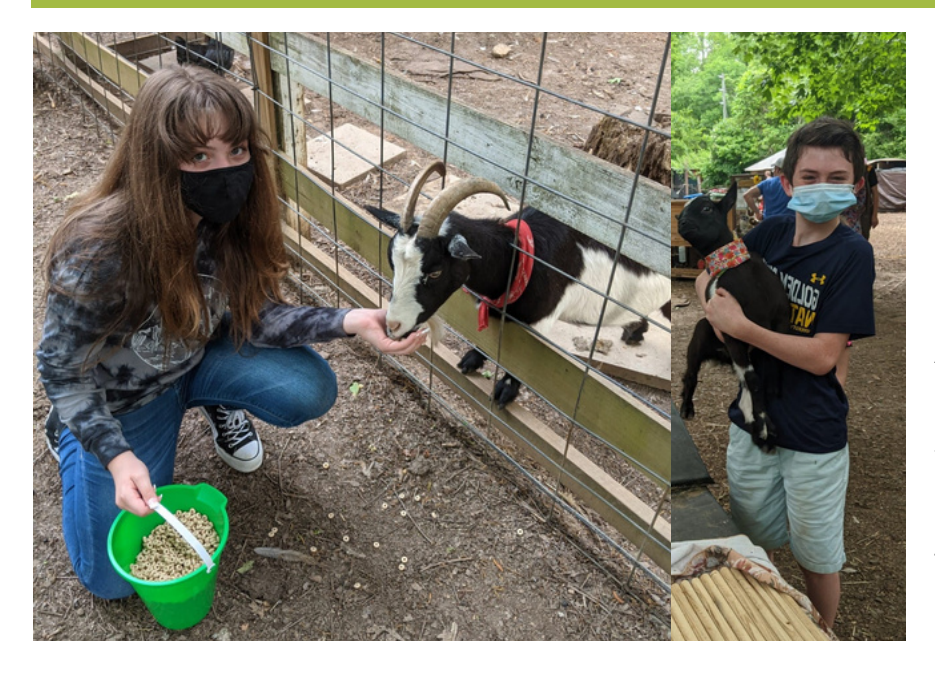
Children get hands on with feeding & handing animals at a JLC petting zoo event in 2020