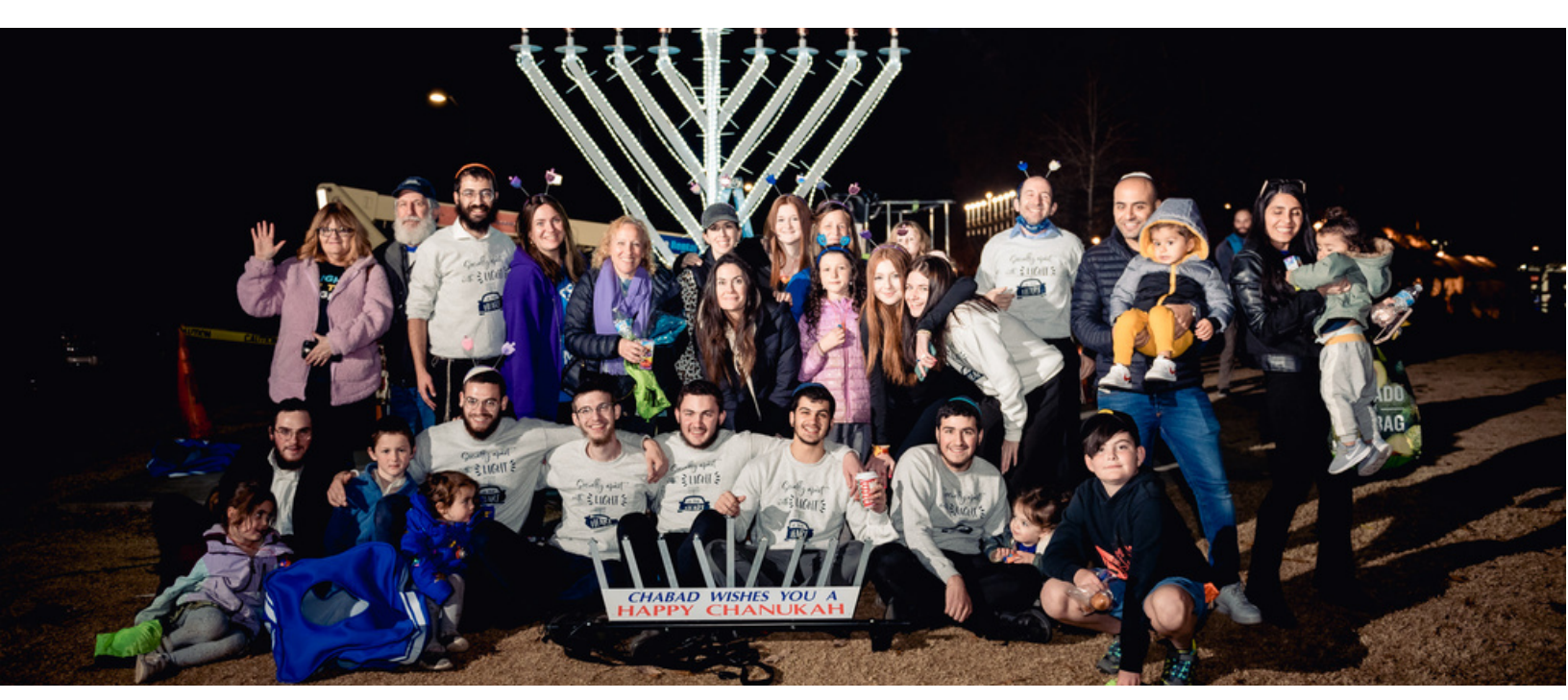
Community volunteers stop for a picture in front of the grand Menorah