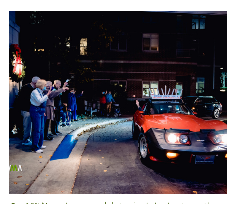
Our 2021 Menorah car parade brings joy to local senior residences