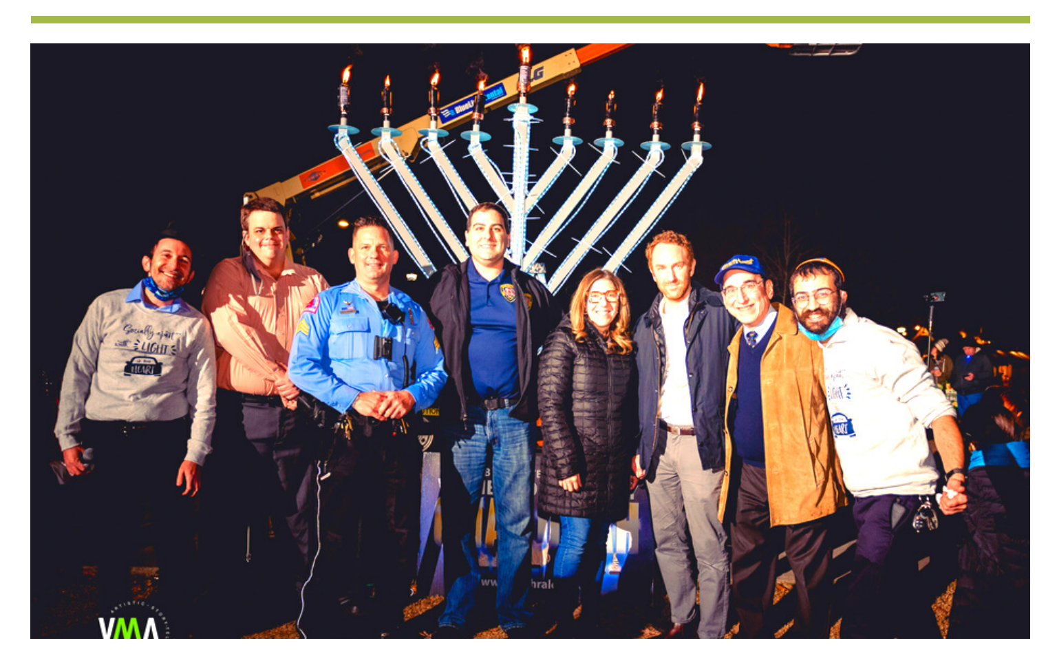
Lighting the Grand Menorah @ Chanukah event

This year's honoree will be determined closer to the event.